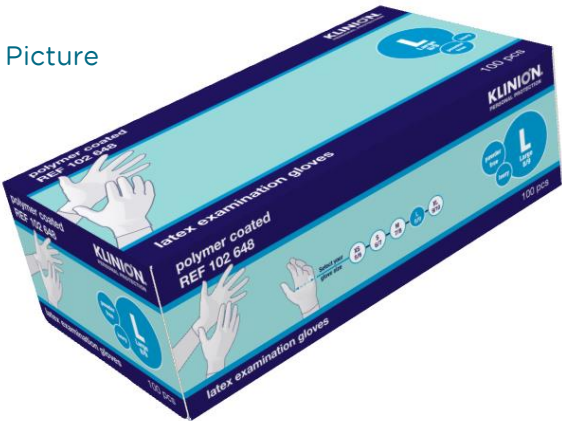
Ref. product 102648